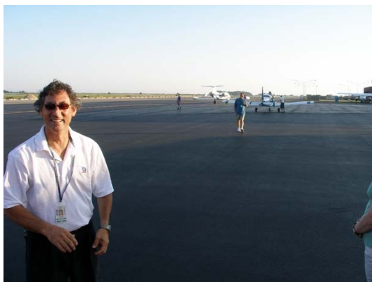
“It was parked right here!!”