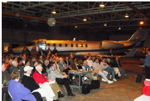
Full House for April's Meeting!