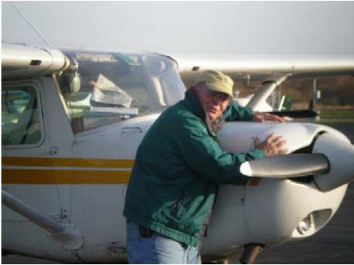
Shipwreck showing the proper way to mount an airplane.