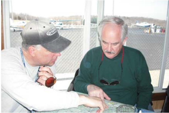
No, no—I think this is Rte 2.